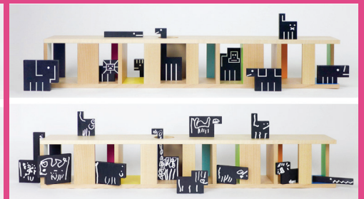
OOLL & ZZI Zoo Stable & Puzzle Animals