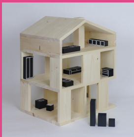
LLA & LLIO Dolls Villa & Furniture Blocks